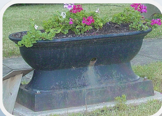
The History Center on Main Street - Time Travel Headquarters Since 2011