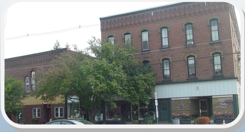
The History Center on Main Street - Time Travel Headquarters Since 2011