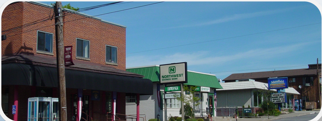
The History Center on Main Street - Time Travel Headquarters Since 2011