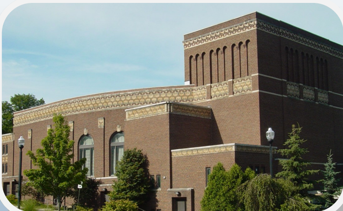
The History Center on Main Street - Time Travel Headquarters Since 2011

The Triangle displays the Mansfield University sign. Until the World War Two scrap metal drive, a Civil War cannon was here.